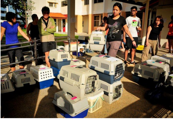
Cats checking in at Bedok drop-off point