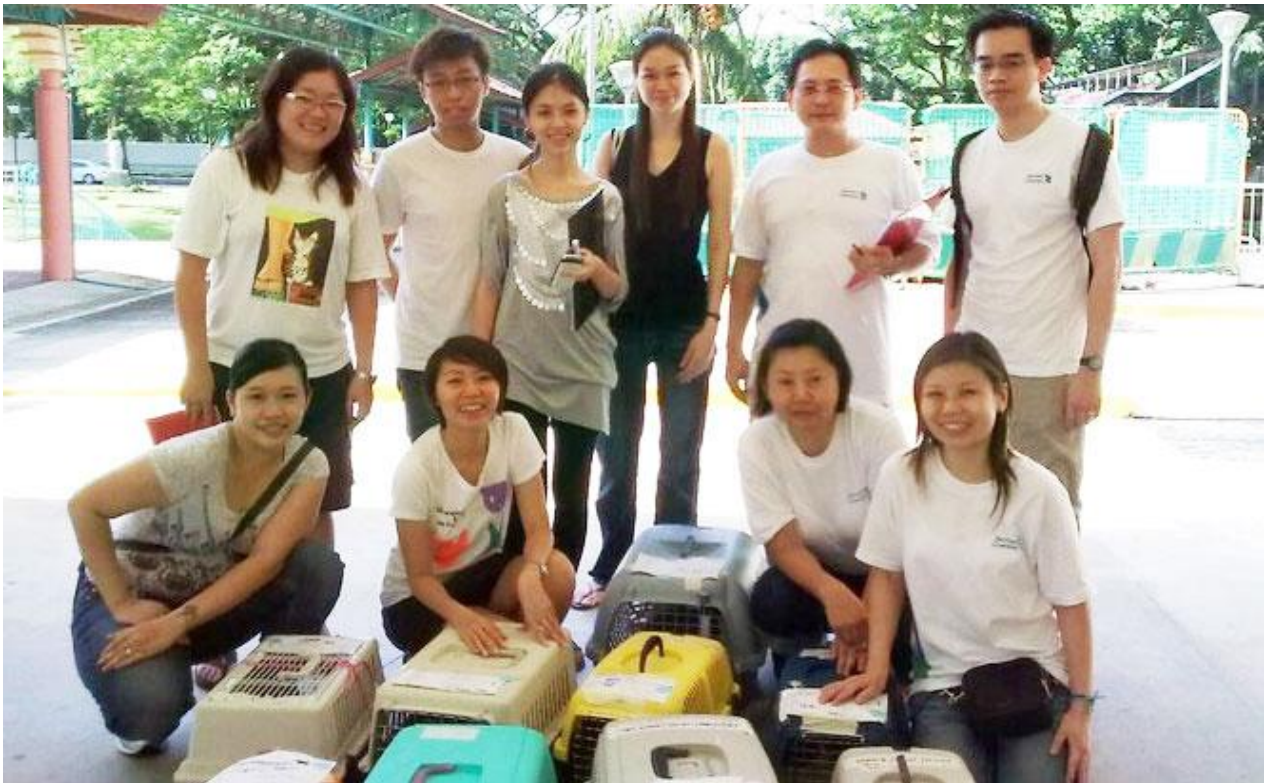
The AMK Spay Day Team