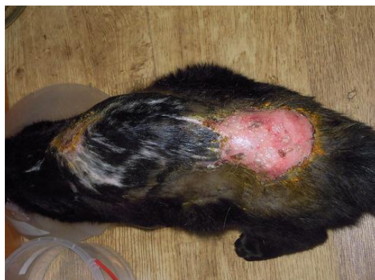
$945 was successfully raised for Yakult, a community cat who suffered scalded skin through abuse.

Our Special Appeals section also raises awareness and funds for mass sterilisation projects.